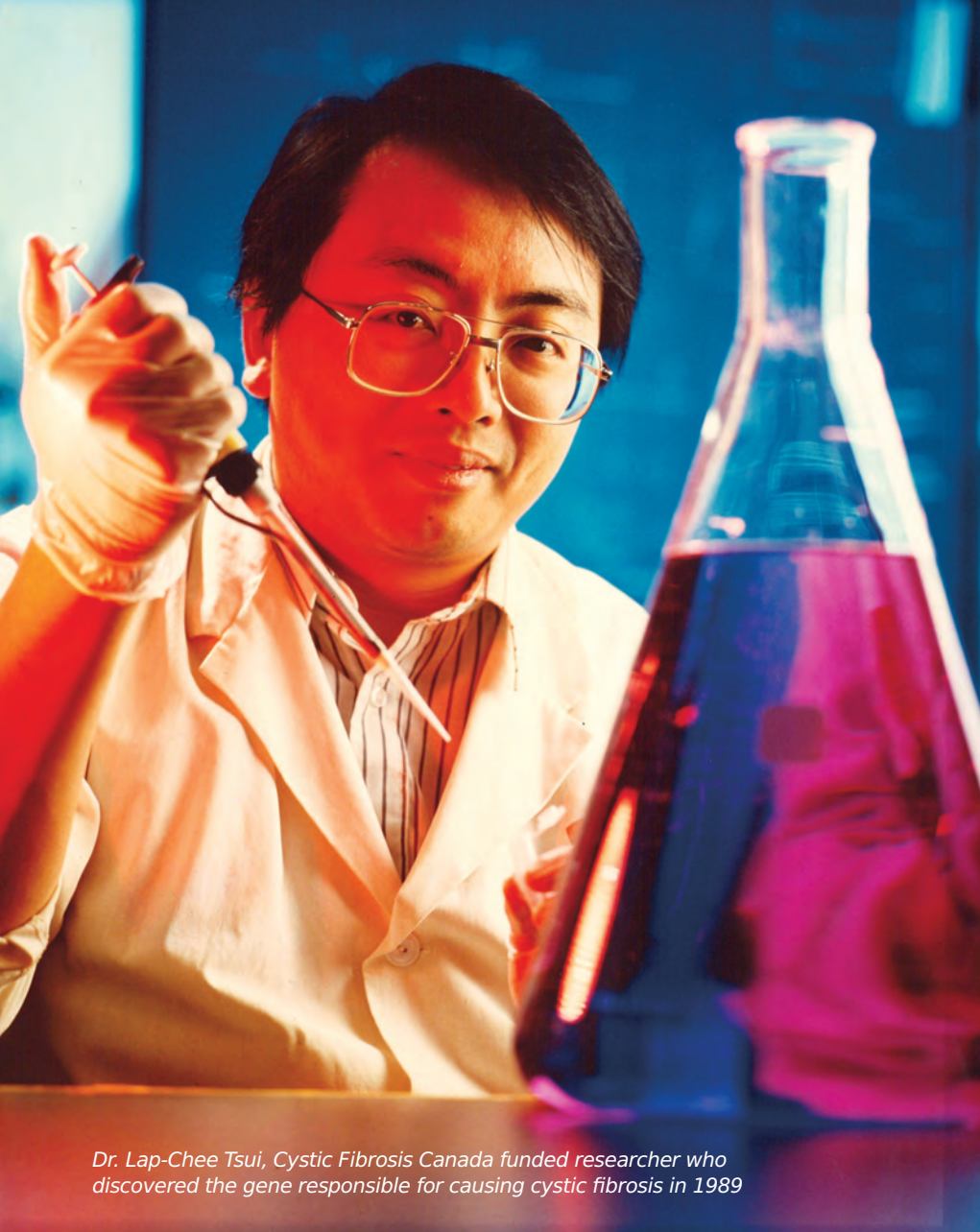
Dr. Lap-Chee Tsui, Cystic Fibrosis Canada funded researcher who discovered the gene responsible for causing cystic fibrosis in 1989